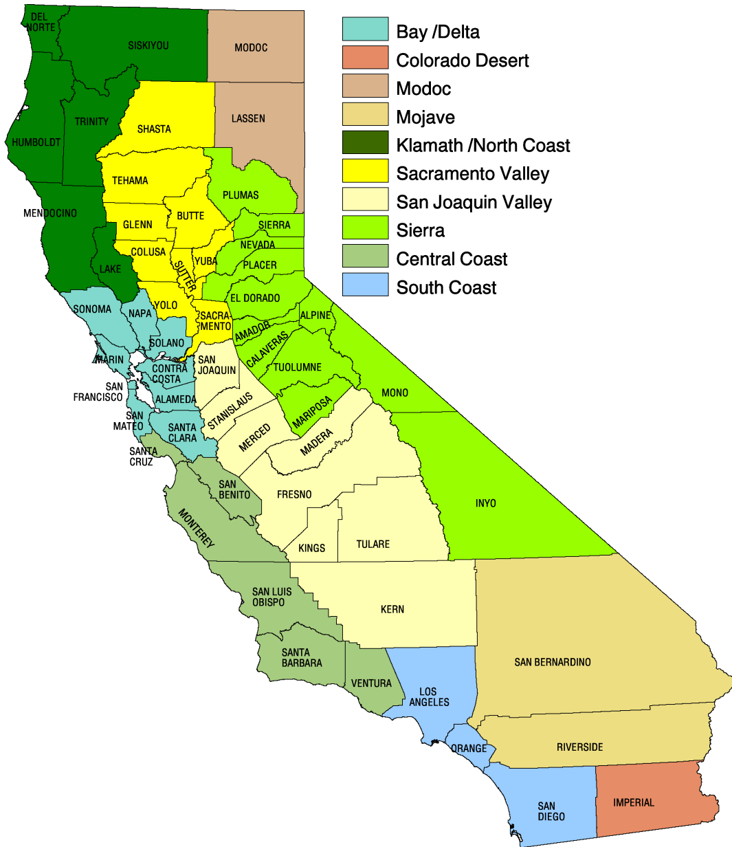
Figure 2. County-based bioregions